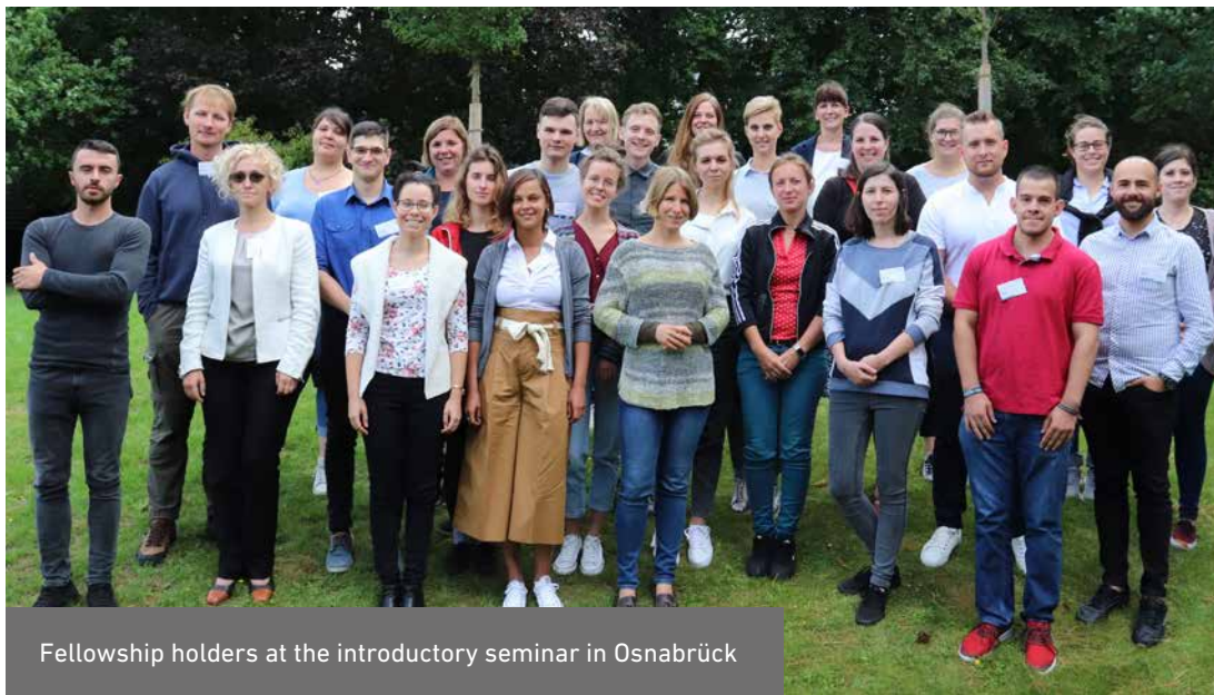
Fellowship holders at the introductory seminar in Osnabrück