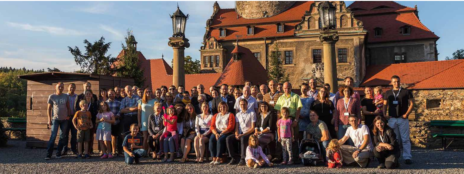
Group of Polish fellowship holders at annual alumni meeting

Germany. The alumni associations organise annual meetings and other meetings (e.g. regulars' tables) in their countries, which also serve to integrate returning fellowship holders into the association. In addition, they organise international professional events and maintain cross-border cooperation. The alumni associations also send representatives to important DBU events in Germany, e.g. the annual presentation of the German Environmental Award, the Week of the Environment at the German Federal President's residence, the annual international alumni workshop for the exchange between the alumni associations.